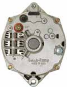
93062 Remy 12SI 100 AMP with R terminal 100% New