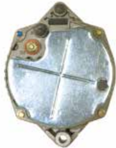
53170 Remy 10SI 63 AMP with R terminal Remanufactured