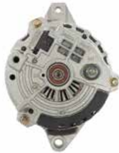
53172 Remy CS130 105 AMP Remanufactured