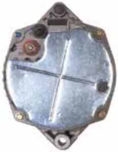
53165 Remy 10SI 42 AMP with R terminal Remanufactured