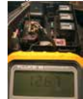
Figure 14 ELD grnd conn