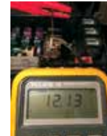
Figure 13 ELD B+ conn