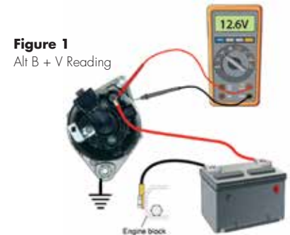
Figure 1 Alt B + V Reading