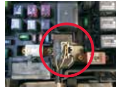
Figure 11 ELD top fuse box