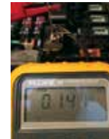
Figure 15 ELD PCM V decrease