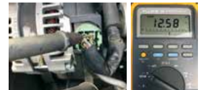
Figure 3 IG Connector, Sys V